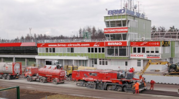
Brno, Czech Republic