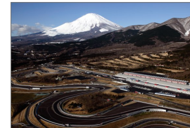
Fuji Speedway, Japan