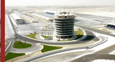
Bahrain International Circuit, Bahrain