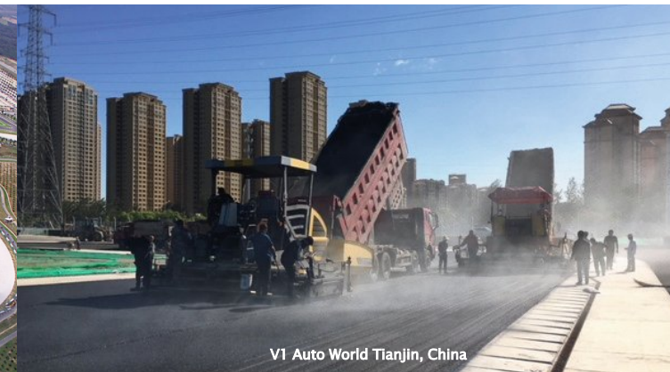
V1 Auto World Tianjin, China