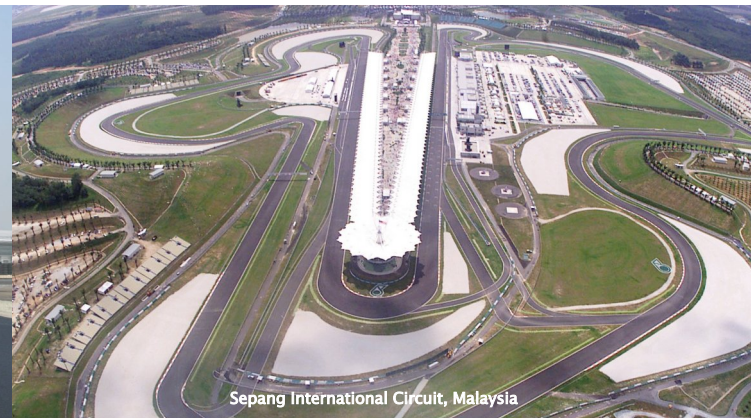
Sepang International Circuit, Malaysia