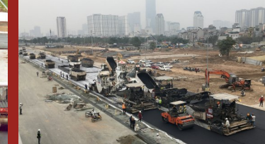
F1 Hanoi City Circuit, Vietnam