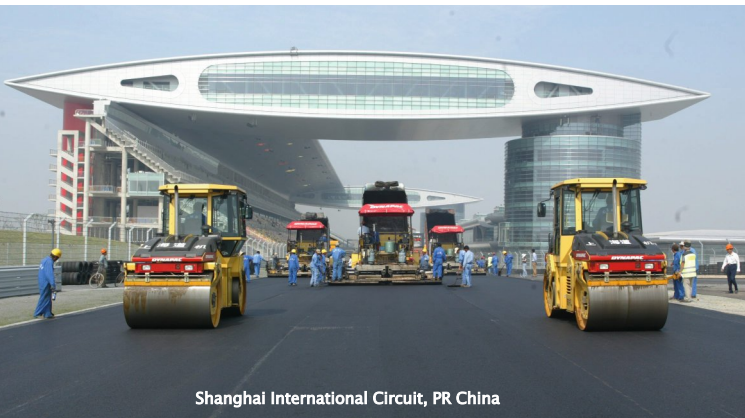
Shanghai International Circuit, PR China

Quality management system according to DIN EN ISO 9001 Approved according to DIN EN ISO / IEC 17025:2000