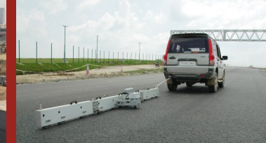
F1 Track Greater Noida, India