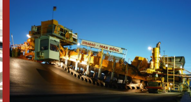
Opel Test Track Dudenhofen, Germany