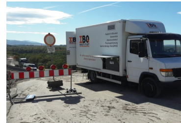
Mobile Asphalt Laboratory

Quality management system according to DIN EN ISO 9001 Approved according to DIN EN ISO / IEC 17025:2000