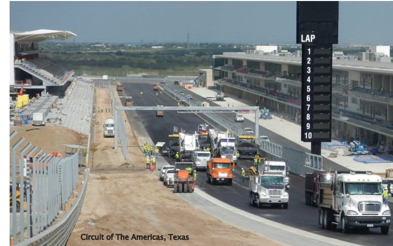
Circuit of The Americas, Texas

phone +49 2637 9449620 e-mail mailbox@ConsultantHart.com web www.ConsultantHart.com